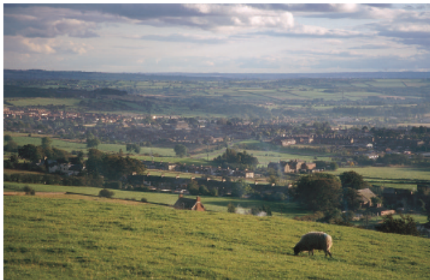
The market town of Crook seen from Dowfold Hill.