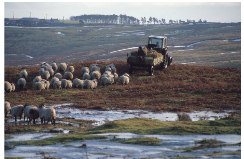
Feeding sheep on Muggleswick Common.