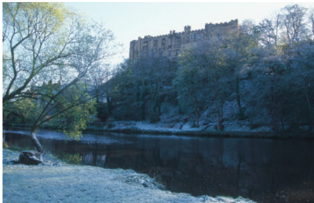
Durham Castle from the riverside path.