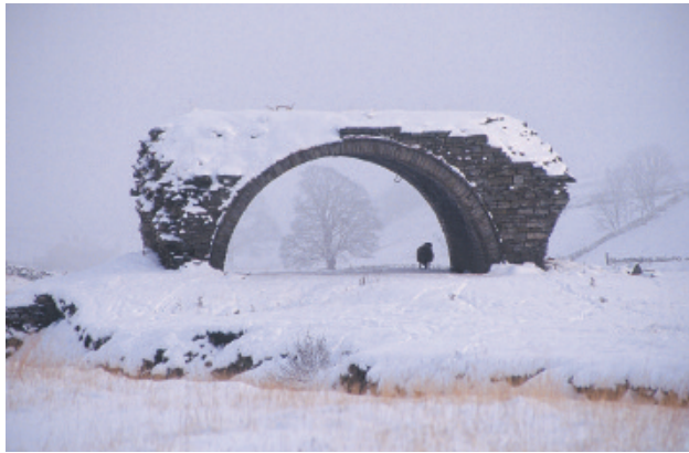
Rookhope Chimney Arch is almost all that remains of the massive lead-smelting mill that worked here during the Industrial Revolution.